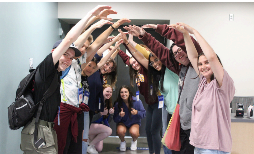
Dance and game night